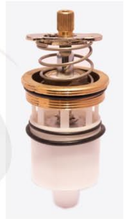
Jaguar Type Metropole Fitting - 40MM