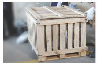
Packing & Dispatch