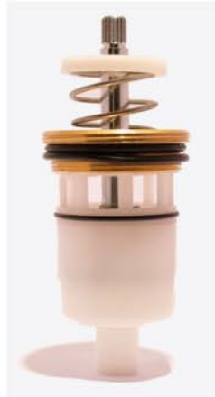
Cera Type Metropole Fitting - 40MM