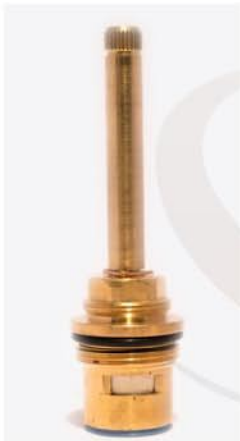
Flush Valve Spindle