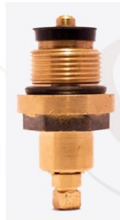
Jaguar Type Old Lock Fitting