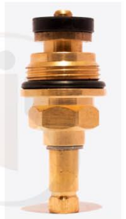
Jaguar Type New Continental