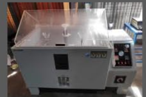
Salt Spray Test