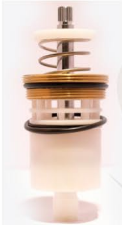
Goldline Type Metropole Fitting - 40MM