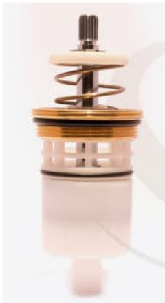
Plumber Type Metropole Fitting - 40MM