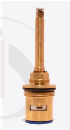
ES5 - ES5 Type Ceramic Flush