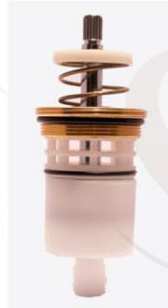
Mark Type Metropole Fitting - 40MM