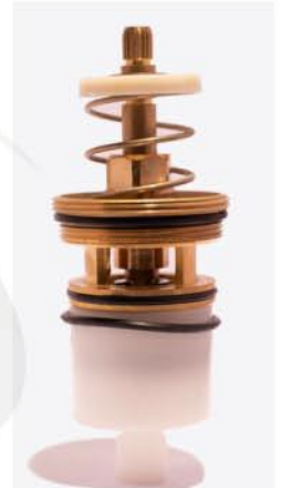
Parryware Type Metropole Fitting