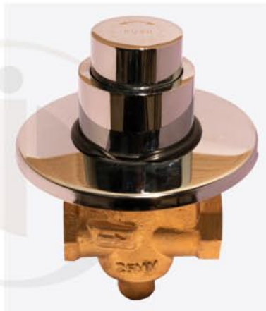
25MM Full Metropole Set

We are manufacturer and exporter of Brass Bathroom Fittings, Brass Sanitary Fittings, Bathroom Spindle, Brass Waste Coupling, Brass Bathroom Accessories and Extension Nipple. The products we offer are the acute combination of brass with other metals & alloys. Our employees has a detailed knowledge of manufacturing works and this benefits us in becoming one of the prominent brass parts companies of the market. The people we have hired get complete support of the tools and machines that are installed in our building, using which they design Brass Bathroom Fittings with perfection. Further, owing to strong support of our resources, we are fulfilling demands of numerous clients for Brass Bath Fittings. We assure our customers that the variety of products we provide is wide & impressive and cannot found anywhere at such reasonable rates.