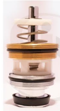
Aquel Type Metropole Fitting - 40MM