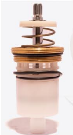
Elvis Type Metropole Fitting - 40MM