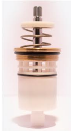
Parryware Type Metropole Fitting - 40MM