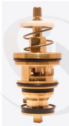
Parryware Type Metropole Fitting