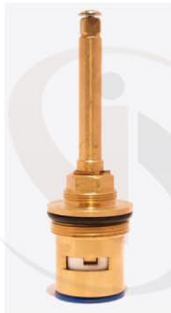
Jaguar Type Goldy Square