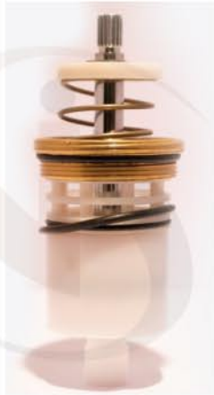
Cera Type Metropole Fitting - 40MM