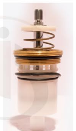
Aris Type Metropole Fitting - 40MM