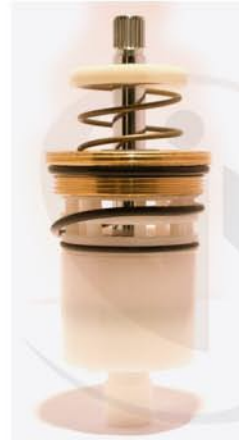
Jaguar Type Metropole Fitting - 40MM