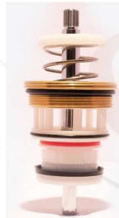
Hindware Type Metropole Fitting - 40MM