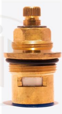
Plumber Type Aztech