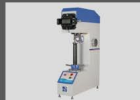
Hardness Testing Machine