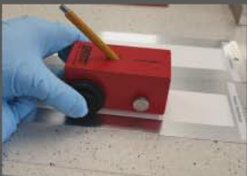
Pencil Hardness Test

Instruments are heartbeats of industry. To assure good quality of products, quality instruments are required. Company has invested a good amount to have all type of measuring equipments including all instruments and gauges.