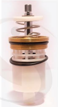
Hindware Type Metropole Fitting - 40MM