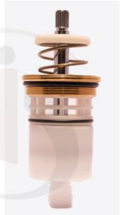
Cera Type Metropole Fitting - 40MM