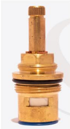
Queen - 1 PC Clockwise & 1 PC Anti Clock Wise