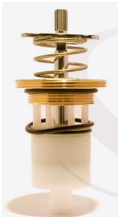
Jaguar Type Metropole Fitting - 32MM